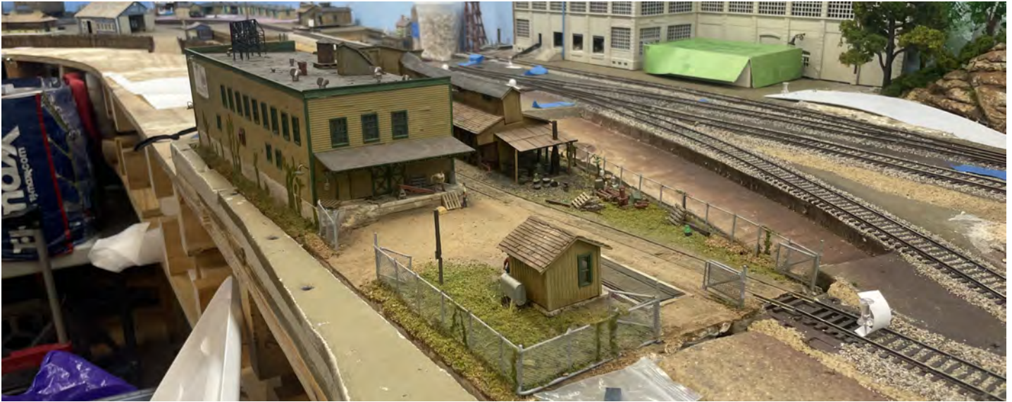
▲ An industry from Gil Freitag's layout