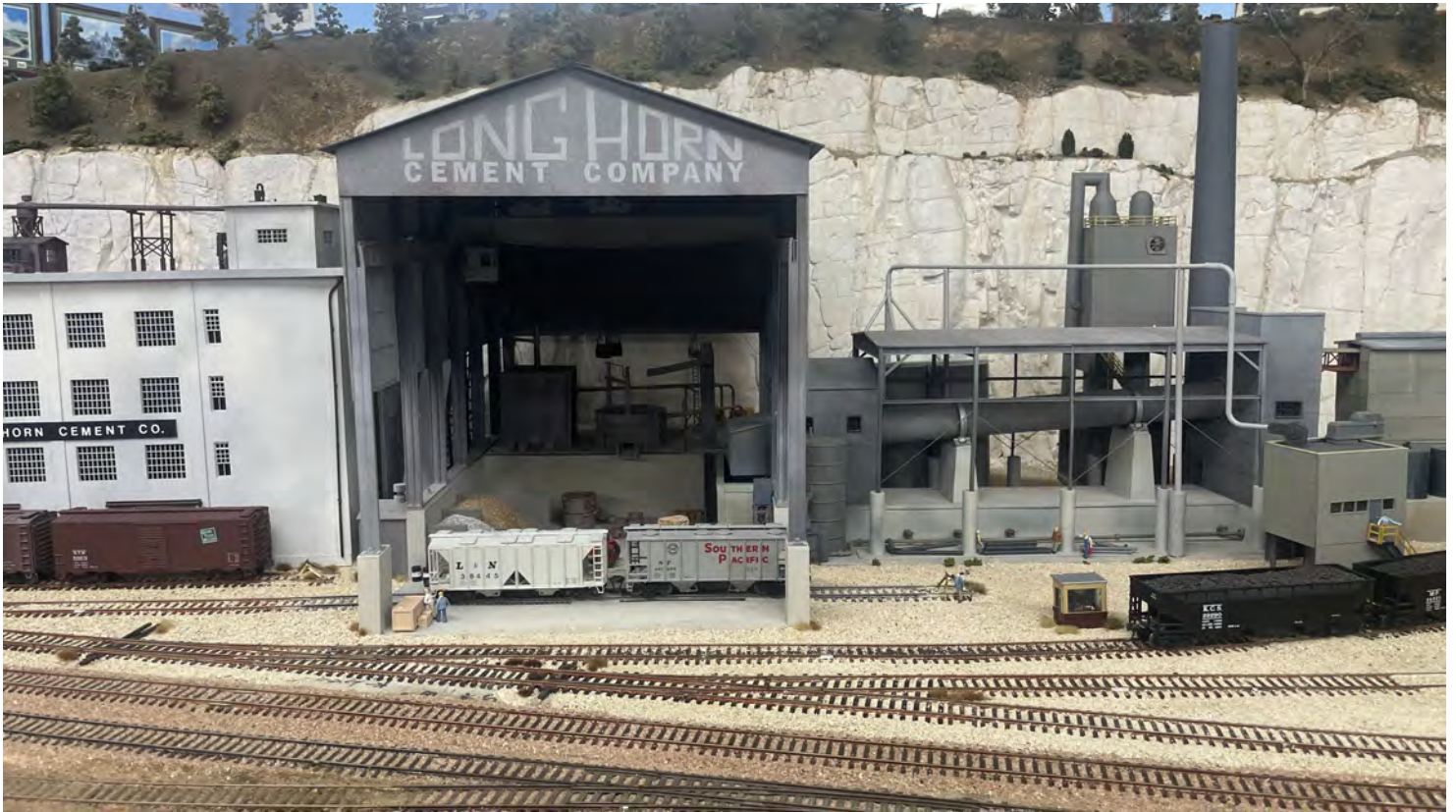
▼ San Antonio Station