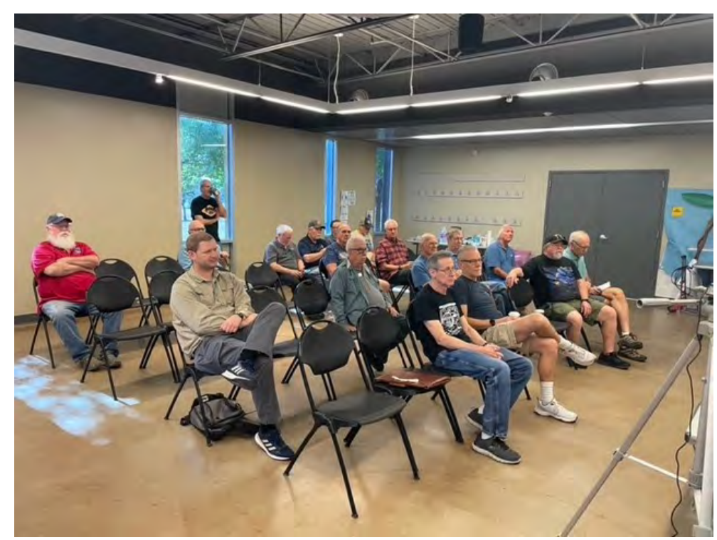
A good turnout of "the usual suspects"