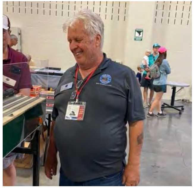
The Head Honchos Train Show Wrangler Division Superintendent