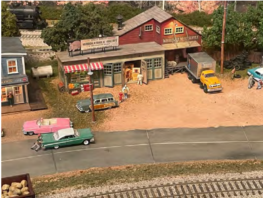
Two guys on their way to the Texaco Station passing Uncle Tony's Meat Market.