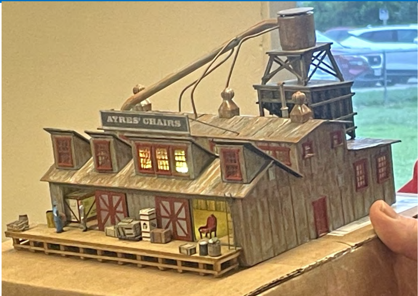
Nice job on the weathering! The chair just inside the loading dock is also a nice touch.