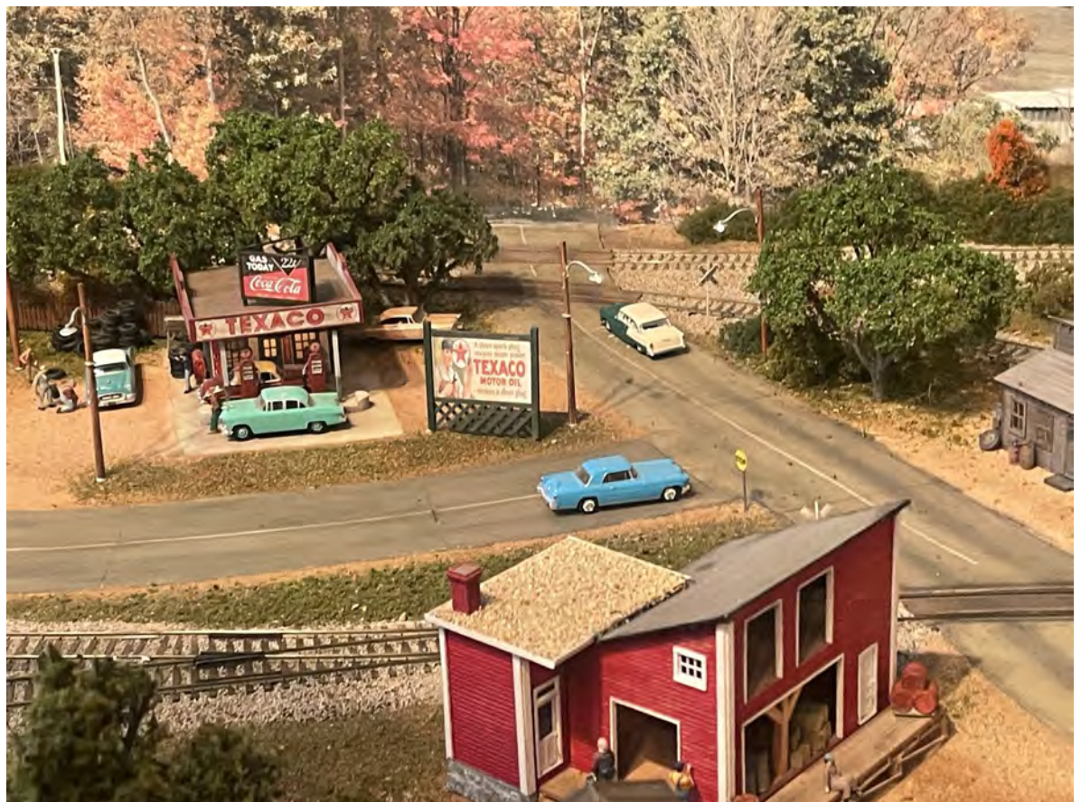
It's a busy day at the Texaco Station.