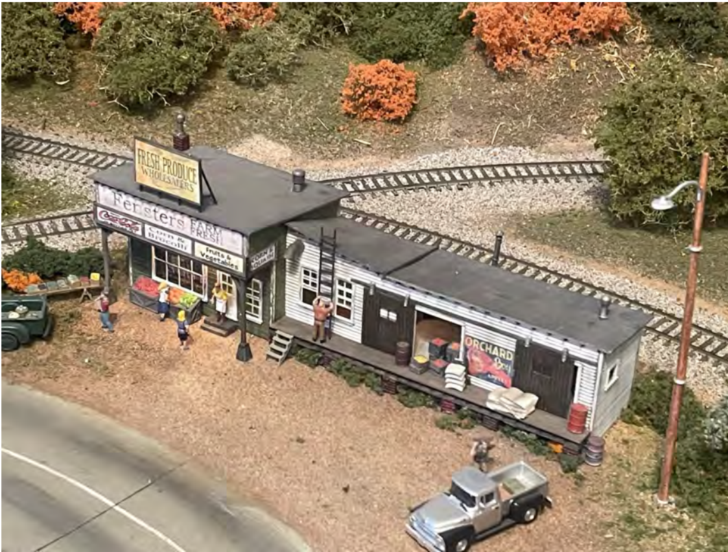
The fall harvest is available at the Fensters Farm Fresh Produce stand.