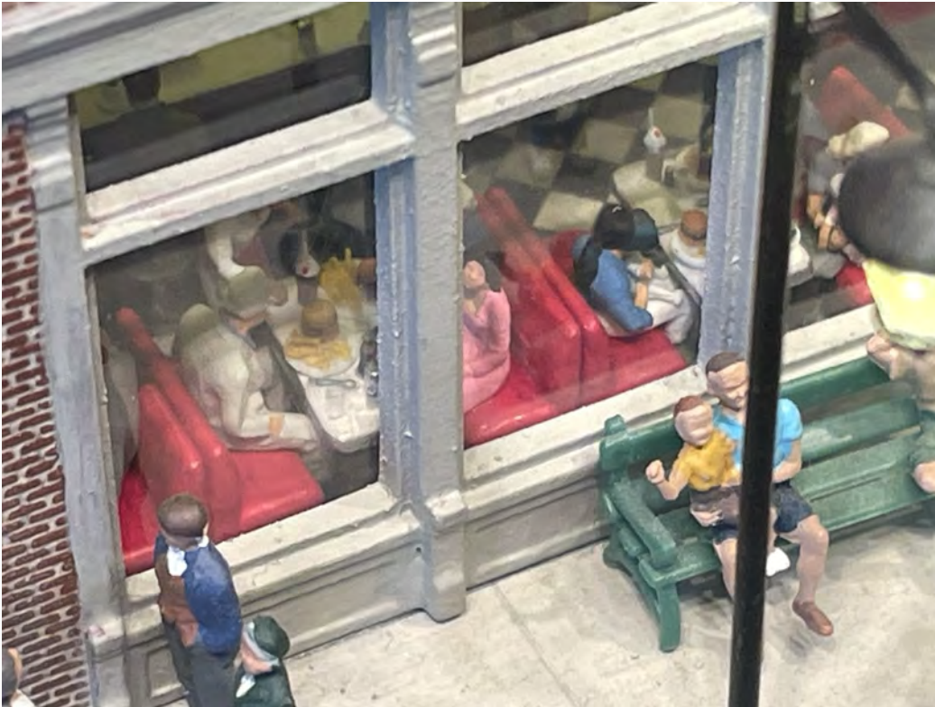
Hamburgers, Fries, and Shakes at the diner.