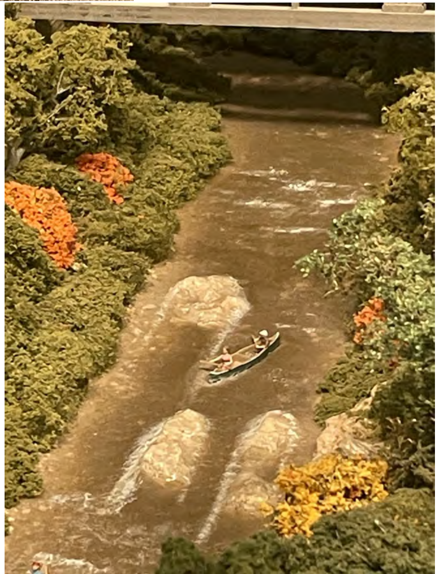
A young couple gets one last cruise on the river before the snow arrives.